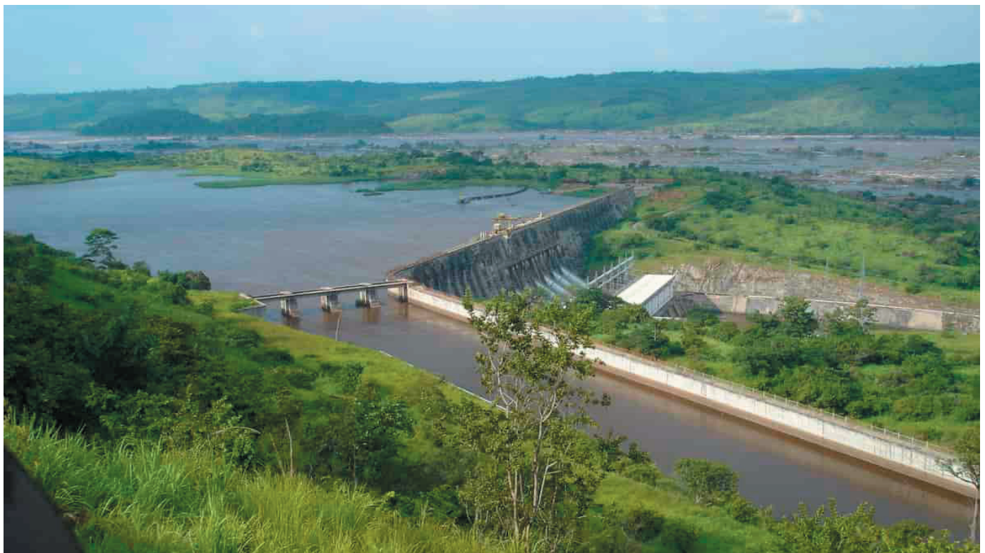
The Inga III dam power plant in the Democratic Republic of Congo

The case studies , which are all available in full online, are analysed through the lens of the four interconnected pillars we consider essential to characterise sustainable infrastructure: economic, governance, ecological and social (see Figure 1 above). They encompass diverging approaches towards infrastructure finance and development (see Box 5). One approach is geared towards private sector interests, which conceives infrastructure as an asset class, prioritising large-scale projects that contribute to a growth-oriented and export-led development path. A contrasting approach views infrastructure as a public good meant to serve local communities' needs and human rights, relying on public financing, and active citizen participation.