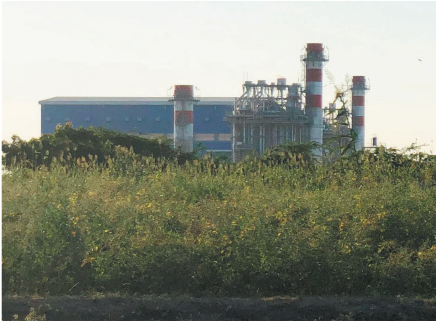
The Myingyan Gas power plant, Myanmar.